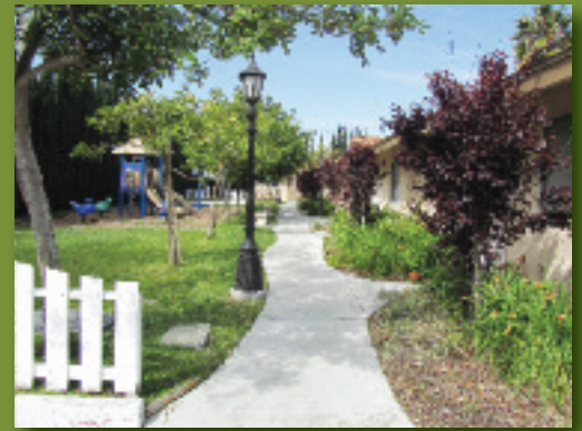
Newhope Second Step Shelter

We excitedly look forward to the future when the final payment is made and we will, once again, be debt free. Please join with us in our continued prayers for God's future direction for the ministry. ✂